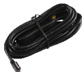
USB-Type C cable